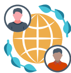
Employee training and development