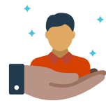
Employee self-serve tools