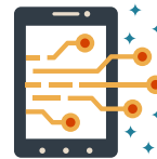
Sophisticated HRIS software